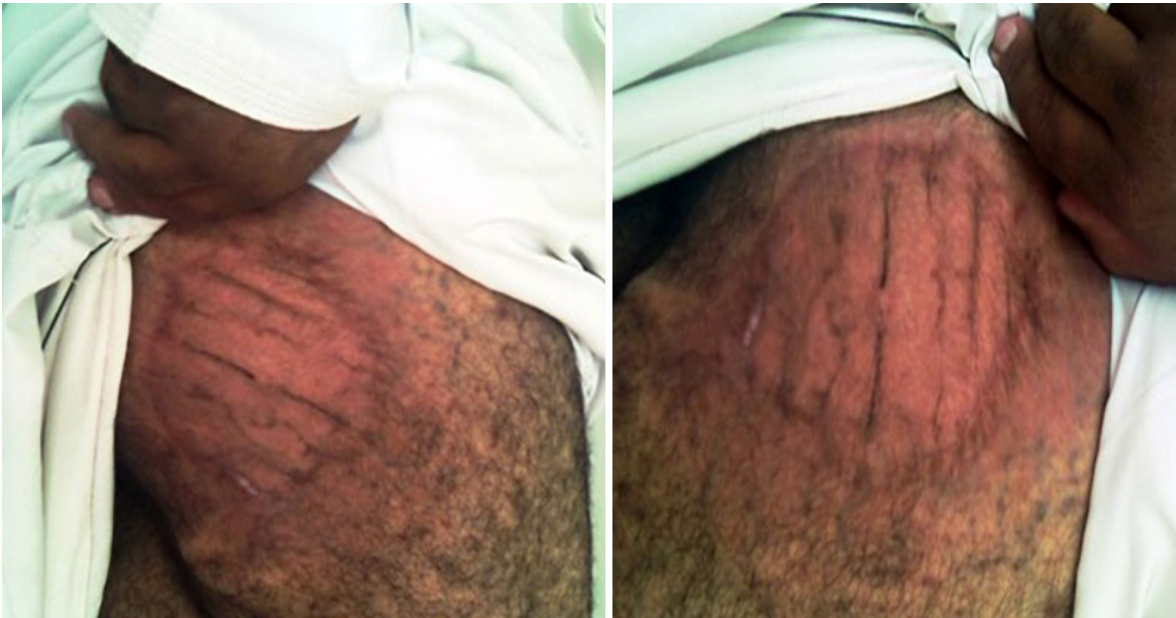
Figure 4: Complete resolution of the infection after combined medical and surgical treatment.

skin and subcutaneous tissue, 2-5 which can spread to involve muscles, bones and neighboring visceral organs. 6,7 Two groups of mycetoma exist with similar