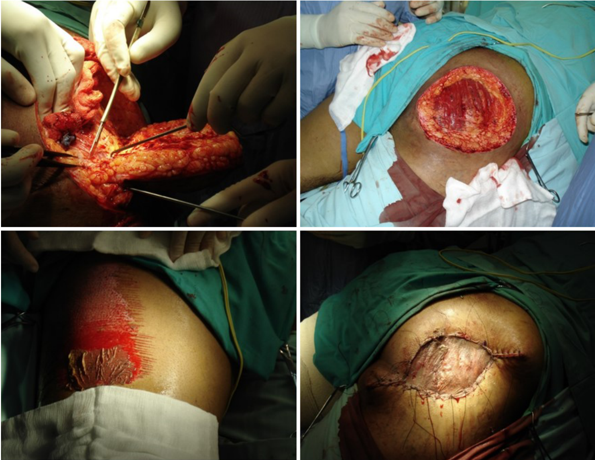
Figure 3: Excision of the affected area along with partial thickness skin graft.