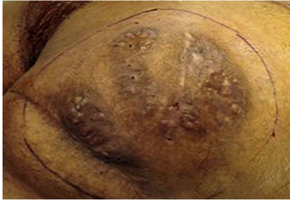
Figure 1: Right gluteal region showing the classic triad of mycetoma: tumefaction, draining sinus tracts and discharge of granules. .

including trimethoprim-sulfamethoxazole (SXT), aminoglycosides and amoxicillin-clavulanate. However, no clinical response was obtained.